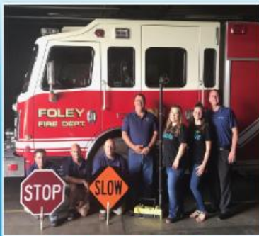
FOLEY FIRE DEPT Upgraded Safety Equipment Purchase