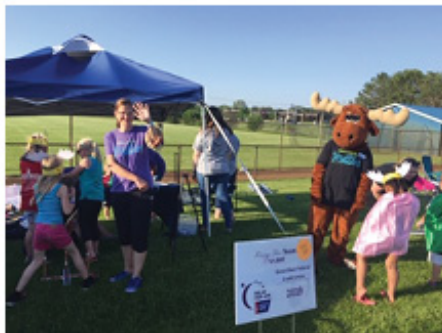
Relay for Life June Sponsoring and participating in the Relay

Visiting with and transporting patients at the St. Cloud VA Hospital