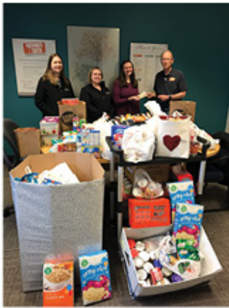
Shred-a-Thon Donations to Pathways4Youth April

Thank you for all of your donations which have gone to help homeless youth in the Saint Cloud area