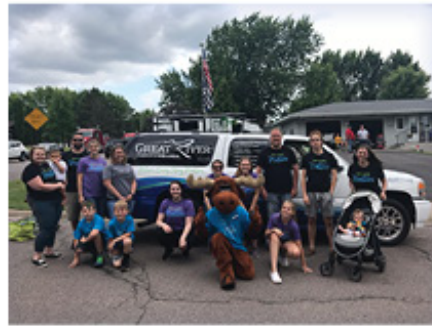
Sauk Rapids Parade June

Thank you for all of your donations which have gone to help homeless youth in the Saint Cloud area