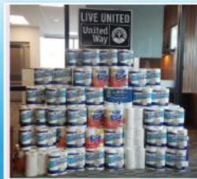
UNITED WAY TOILET PAPER DRIVE