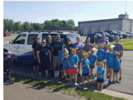
Sartell Parade June Marching and passing out candy at the parade