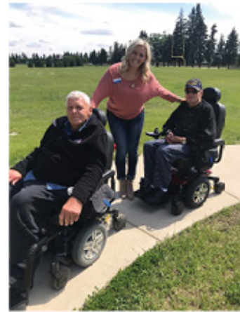
VA Hospital June

Marching with Marvin the Moose in the parade