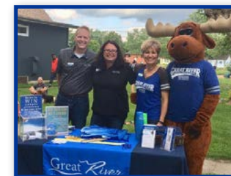
NATIONAL NIGHT OUT PROMISE NEIGHBORHOOD