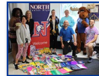
SCHOOL SUPPLY DONATIONS