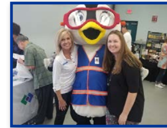
ELECTROLUX EMPLOYEE JOB FAIR