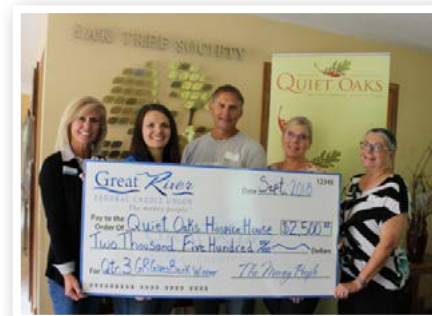
Quiet Oaks Hospice House

Send submissions to marketing@GreatRiverFCU.org