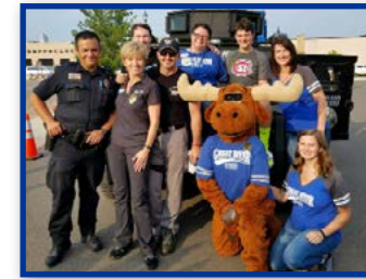
BACK TO SCHOOL BASH